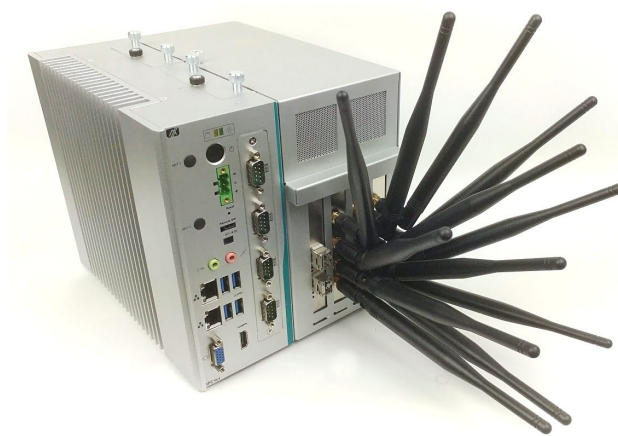
Larger Images: With Antennas No Antennas

NOTE: This product may have a different hardware configuration than the system pictured above. Refer to your official quote for details.