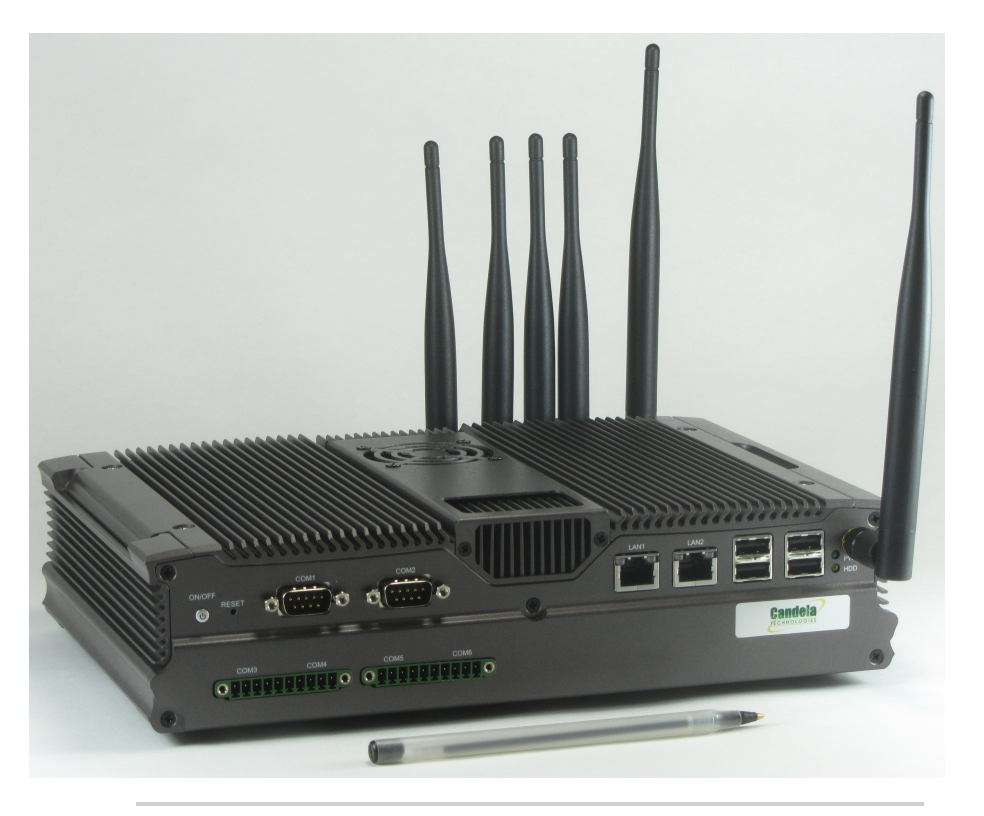
Candela Technologies Inc., 2417 Main Street, Suite 201, P.O. Box 3285, Ferndale, WA 98248, USA

The CT521-128 has one small and quiet fan and 6 antenna. It will fit into a small travel bag or briefcase for easy portability. No additional hardware or software is required, but it is suggested that you manage the system using the LANforge-GUI on a separate machine. The CT521-128 can also be managed over a serial console in text mode or through a directly connected monitor, mouse and keyboard.