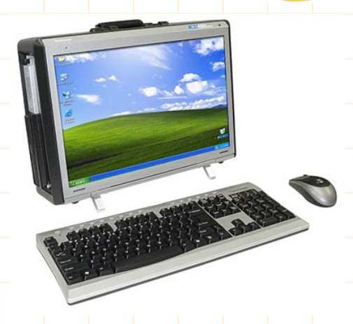
Rugged Portable PC