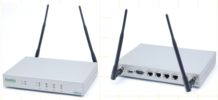
WiFi Compact Network Appliance